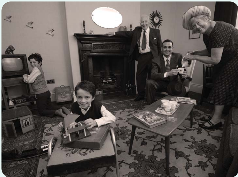
1950's at Beamish

For more information contact the Museum Learning Team on 561 2323 or visit www.seeitdoitsunderland.co.uk/sunderland-museum-winter-gardens