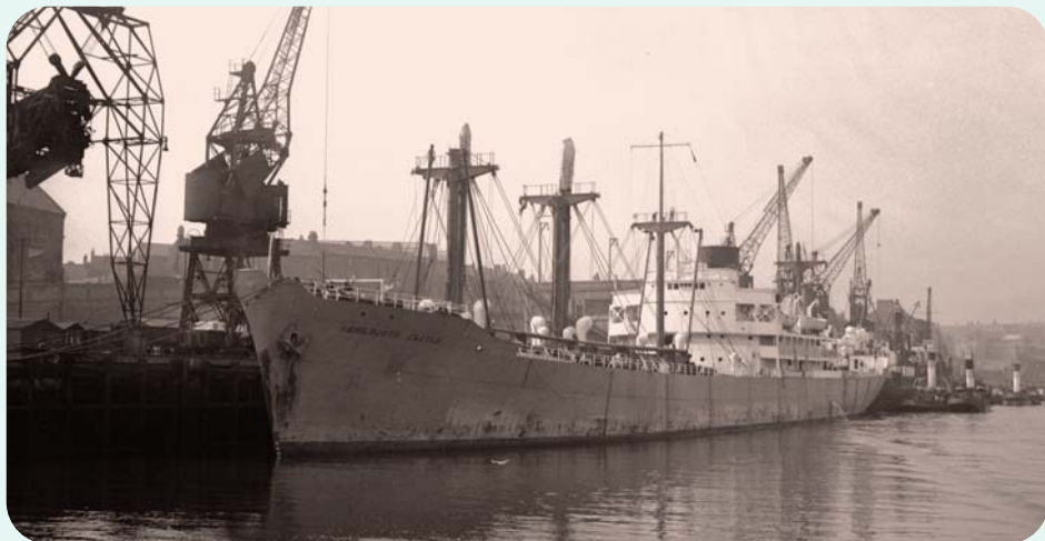
Cargo liner Kenilworth Castle at Corporation Quay 1949

Every Tuesday in May 2.30-3pm and 3-3.30pm