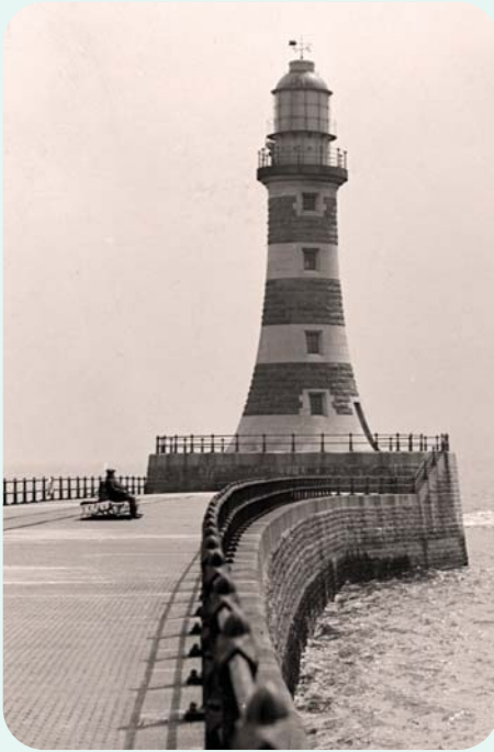
Pre-war image of Roker Pier Lighthouse